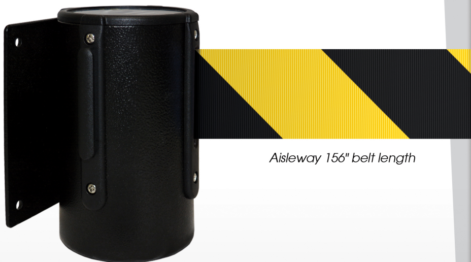
Aisleway 156" belt length

A proven high quality retractable belt that is versatile and mountable virtually to any surface to provide a safety barrier. Use to provide guided barriers for entry and/or exits, stairs, halls, and warehouses. The safety barrier of choice when floor space is limited or an area is too narrow to place normal barriers.