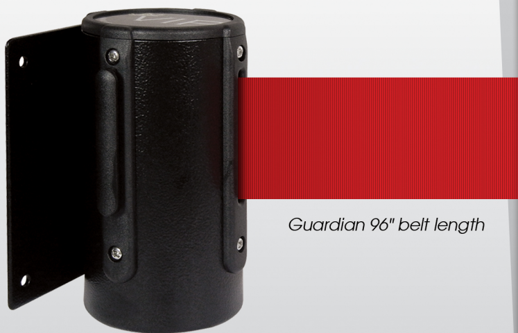
Guardian 96" belt length